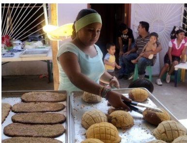
Laguna Teens' Bakery